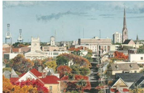
Margaret Peery, born 1941, "Power" (detail of triptych), 2011, watercolor and graphite on paper

For further information check our SC Institutional Gallery listings, call the Museum at 864/271-7570 or visit ( www.gcma.org ).