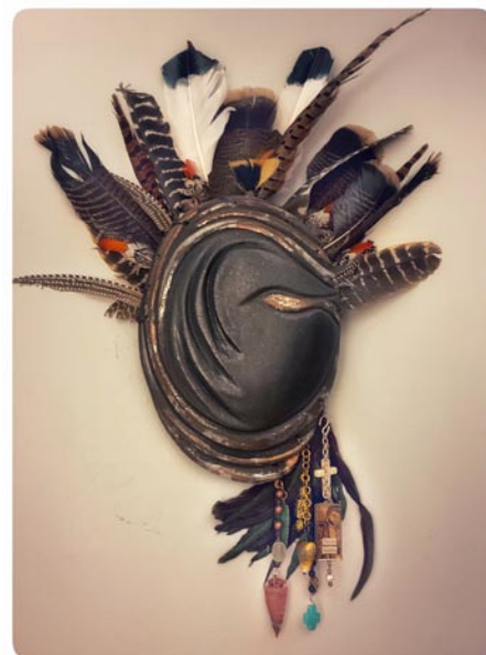
Work by Luck Clark

The Arts Council of Henderson County continued on Page 27