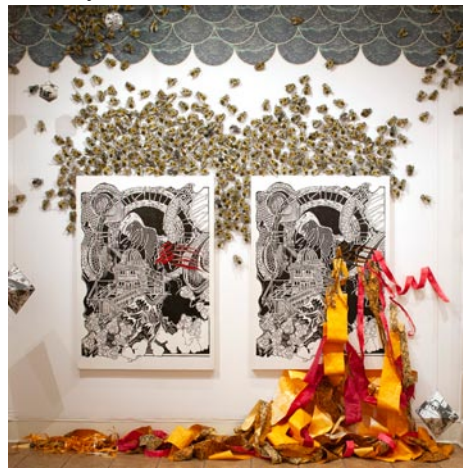
View of an installation by Adrian Rhodes

Our policy at Carolina Arts is to present a press release about an exhibit only once and then go on, but many major exhibits are on view for months. This is our effort to remind you of some of them.