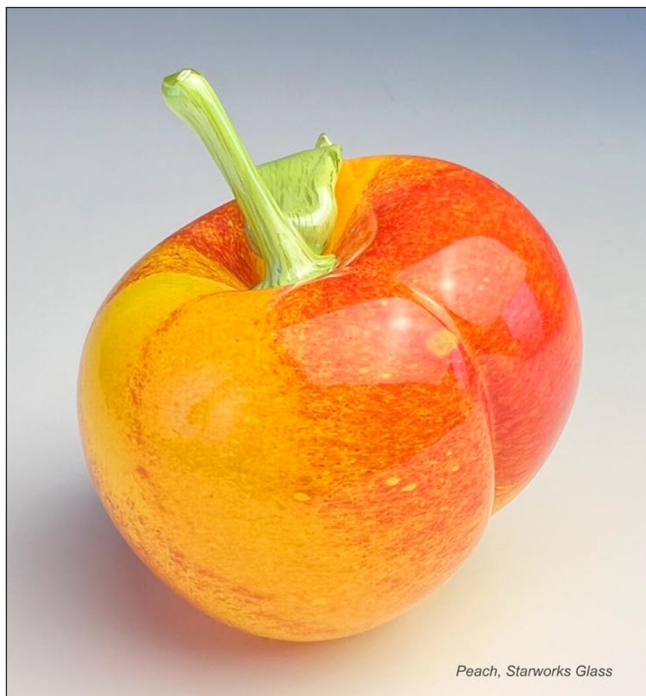
Peach, Starworks Glass