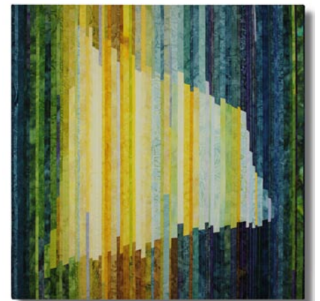
Work by Christine Hager-Braun

Audrey Pinto offered the following statement, "I am a paper and fiber artist who is interested in exploring the margins between contemporary fiber and textile art and craft. I am drawn to the ancient arts of weaving and embroidery - the old crafts where women and community have played a central, collaborative role in the making and creating process. Using paper rather than thread and yarn allows me the freedom to examine weaving using found and recycled materials and to experiment with multiple layers and overlays that bear resemblance to tapestries from the past. My weaving process is intuitive where the placement of each strip of paper tells a story, speaks of a memory or thought, and makes a statement about my personal history and community.