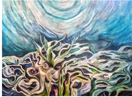
Work by Judy Blahut

This collection of acrylic and charcoal paintings is Blahut's colorful interpretation of underwater environments, balanced between realism and fractured, playful abstraction. These fantastical "waterscapes" are made of sinuous and lyrical forms bathed in translucent light.