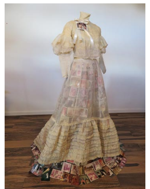
View from a previous installation

Lenz’s work has also been selected for national and international group exhibitions,