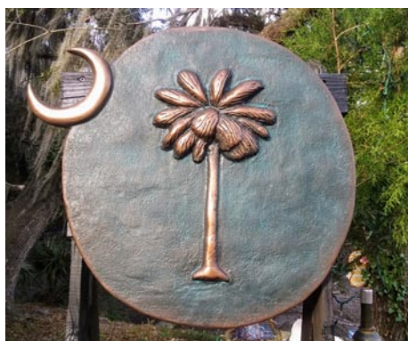
Work by Wally Palmer

His line of palmetto trees, some featuring a South Carolina moon, are delightful. They are all substantial pieces of art that have beautiful patinas – some with iron finishes are rustically rusty, while the bronze finishes have varying degrees of a natural green/blue patina that just looks better and better with age. These sculptures are weatherproof and look amazing in outdoor spaces as well as inside your