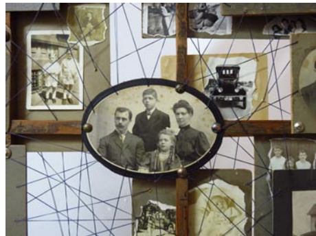
View from a previous installation

Through unnamed subjects, the interactive display presents nostalgic images and stories that are both familiar and unknown. Lenz culled through yard sales and thrift shops to create pieces that make up our collective wall of ancestors and much more. Her works include photo collage Folding Screens, an antique sculptural garment, altered photo albums, scrapbooks and The Wall of Ancestors composed of individually framed images.