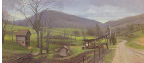
Work by Luke Allsbrook

Good Art Co. , 10 Central Avenue, Greenville. Ongoing - Located in the heart of Greenville, SC, Good Art Co. is a collaborative creative space that fosters camaraderie and builds culture by bringing great local artists + makers together to inspire, engage and educate our community. Hours: Wed.-Sat., 10am-6pm or by appt. Contact: 864/381-7539 or e-mail at ( info@getgoodart.co ).