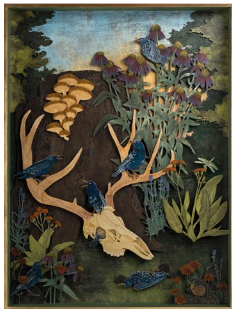
Work by Bess Whittington

Southeast Center for Photography , 116 E. Broad Street, Greenville. Ongoing - An exhibition and education venue promoting the art and enjoyment of fine photography. Through monthly juried exhibitions, local, national and international photographers of all skill levels have the opportunity to have their work presented and enjoyed by collectors, curators, enthusiasts, interior designers, and colleagues. In addition, exceptional photographers will be invited to participate in solo or group shows. Our workshop and class schedule cover all aspects of photography and challenges, encourages and inspires the photographer in all of us. Hours: Wed.-Sat., 10am-5pm and First Fridays until 9pm. Contact: 864/605-7400 or at ( www.sec4p.com ).