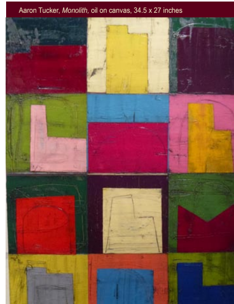
Aaron Tucker, Monolith , oil on canvas, 34.5 x 27 inches

continued above on next column to the right