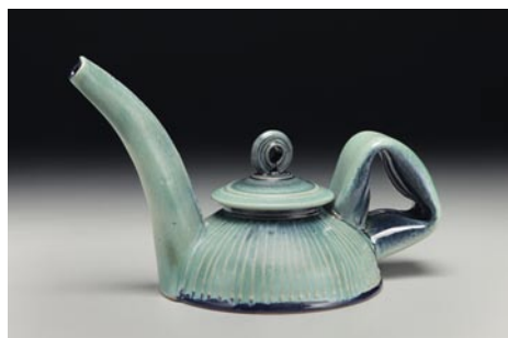
Work by Sue Grier.

The teapot is perhaps the most visually and culturally loaded pottery form – challenging potters through the ages. It provides many possible avenues of exploration.