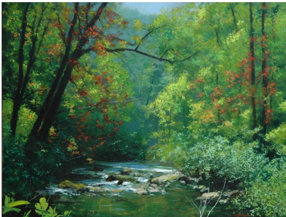
Late Summer on the Chattooga River