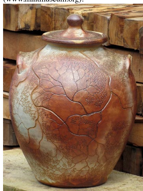
Work of From the Ground Up pottery