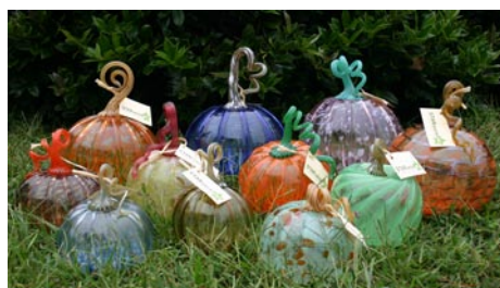
Glass pumpkins from STARworks Glass Lab