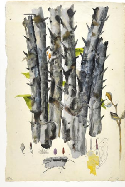
Flora Brasiliensis #158, 2011, watercolor, gouache, conte, pencil, ink, and 1870 botanical illustration, handmade paper, 19.5" x 12.5"