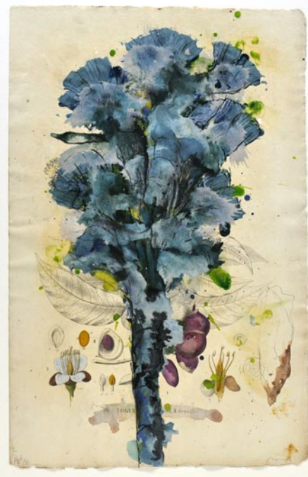
Flora Brasiliensis #150, 2011, watercolor, gouache, conte, pencil, ink, and 1870 botanical illustration, handmade paper, 19.5" x 12.5"

continued above on next column to the right