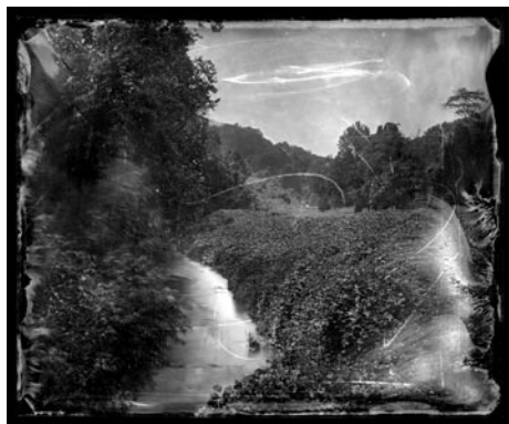
Work by Ben Nixon

Ben Nixon's own photography is often black and white landscapes that look surreal and both foreign and familiar. John Nixon creates collages of medical drawings of human body parts rearranged