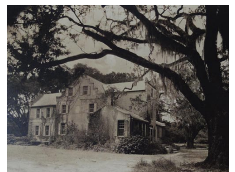
Work by Bayard Wootten

Wootten was born in New Bern, NC, and is well known for her depictions and honest portrayals of daily life of both white and black citizens of the more rural areas from the mountains to the coast of North Carolina. These vintage photographs were taken in the 1930's when she was at the height of her powers. Her work is in the collection of the NC Collection Photographic Archives located at the NC Library at Chapel Hill. She was also featured in a book by Jerry Cotton, Light and