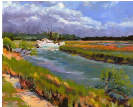
Work by Murray Sease

Sease is inspired by the vibrant local scene, especially the intense colors of the lowcountry in the summertime. She tries to catch the bustle of the farmers markets and the bountiful produce found there: the historic architecture, lush landscapes, beautiful wildlife, and some not-so-wild life—the odd farm animal and her family's chickens enjoying the cool shade and dappled sunlight. These feathered ladies