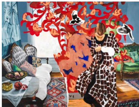
Work by Yvette Cummings

Cummings' current body of work features painted narratives created with a purposefully vague and discordant imagery meant to represent the effects time and distance have on memories of childhood. Dis-jointed imagery, contrasting patterns, and spatial compression represent a snapshots