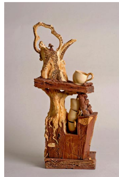
High Tea #6 with Four Cups

The Essence of Forms Contemporary Ceramic Sculpture