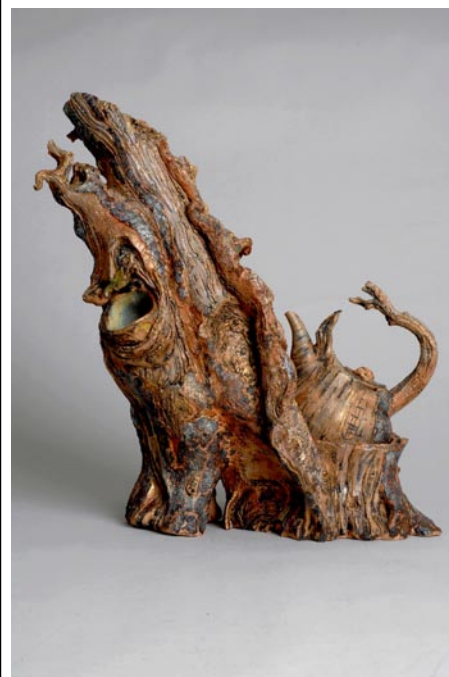
Penjing Tea #5 with Three Cups