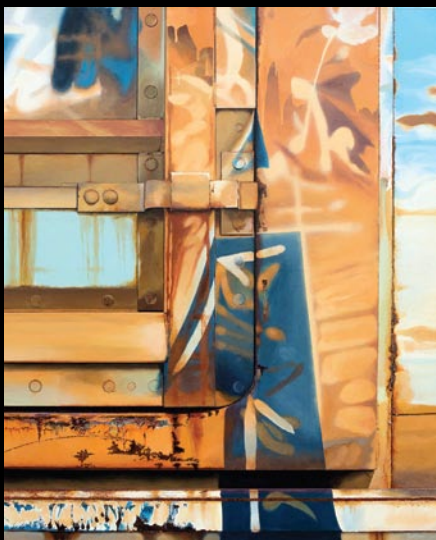
Vandal 60"x 48"