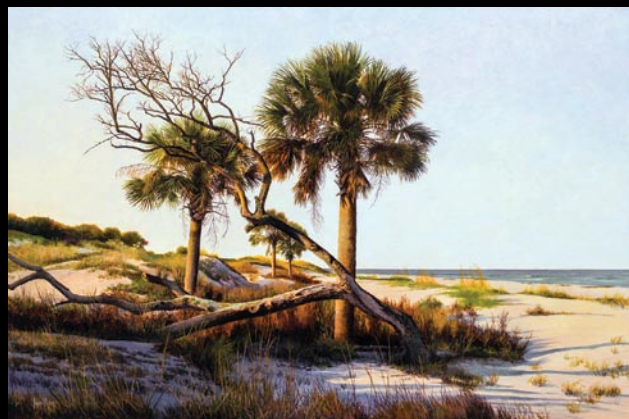
Storm Damage 20"x 28"