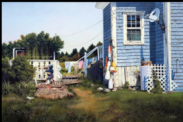
The Blue House 22.5"x 34"