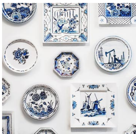
View of installation by Stacy Bloom Rexrode

Heirloom-Worthy consists of approximately 12 works, incorporating both installations and sculptural still life pieces. Included is Rexrode's sardonic and simultaneously playful installation "Quasi-Delft Bequest", an assemblage of 43 plastic plates and three plastic vases decorated with blue permanent marker in the style