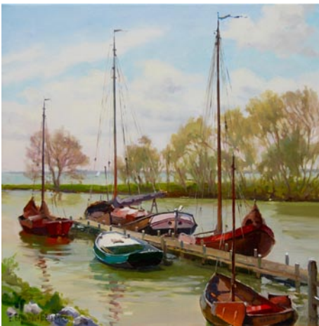
Work by Evgeny & Lydia Baranov

Edward Dare Gallery, 31 Broad Street, between Church & State Sts., Charleston. Ongoing - Located on historic Broad Street's GALLERY ROW in the French Quarter of Charleston, SC, the gallery features an extensive variety of fine art including landscape, figurative, still life & marine paintings plus exquisite pottery, photography, fine handcrafted jewelry, unique works in glass & metal plus bronze sculpture - all by some of the most sought after artists in the low country and accomplished artists from across the nation. Many of the artists represented have a personal connection to Charleston and the coastal Carolinas and tend to include pieces that celebrate the colorful tapestry of the southern coastal culture. Visit the gallery to see crashing waves, lush marshes, still lifes of camellias & oyster shells, coastal wildlife and sensitive yet powerful portraits of the south. Hours: Mon. - Sat., 11am-5pm. Contact: 843/853-5002 or at (www.edwarddare com).