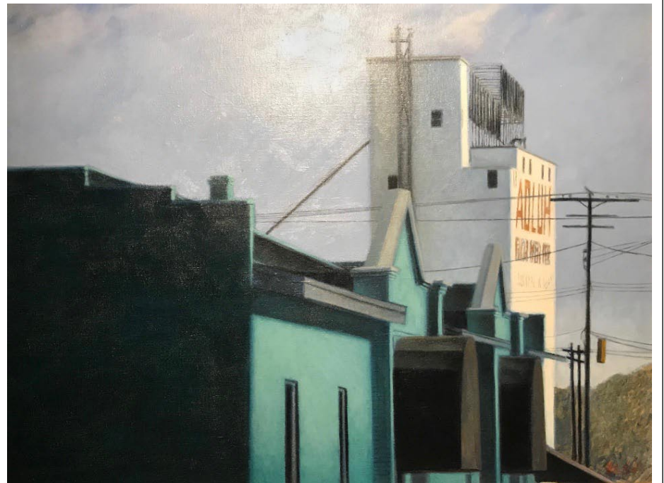
City, Sky 1987 oil on canvas 36 x 48 inches