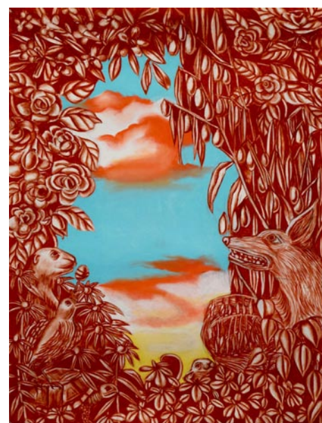
Katie Pell, "Rosy Dawn and Loyalty", 2018, Pastel on paper, 46 x 58 inches

The exhibition consists of 71 pieces - including sculpture, textile, drawing, collage, and an artist's book - in a sprawling four-gallery installation that creates a visual wonderland of images, materials,