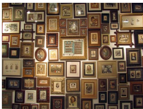
Detail of Installation by Susan Lenz are stitched.

Since her National Park residency, Lenz has continued to use the seemingly insignificant clothing button to communicate issues of gender, race, politics, relationships, and personal narratives. "My work explores the many functions and possibilities of these ordinary objects while challenging viewers to see buttons as more than utilitarian fasteners". Included in this exhibition are several vintage typewriter advertisement and xylene photo transfers of cemetery angels surrounded by hand-stitched buttons. His Secrets and Her Secrets each feature forty, crowd-sourced, close-up snapshots of mouths on which large red and pink buttons