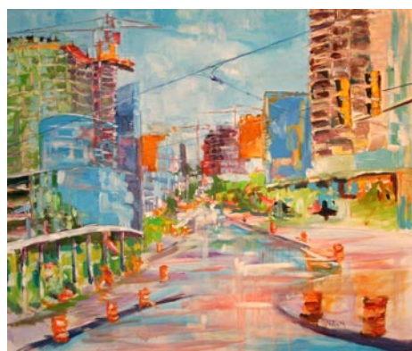
Work by Bruce Nellsmith

Nellsmith reflects on creating the sketches for Buckhead Construction : "I took the train from Midtown Atlanta to Buckhead during what was an historical water main break in the city, what was ordinarily a street filled with bumper-to-bumper traffic was completely deserted. I sat in the middle of the street and produced sketches. Ironically, although there was water everywhere, one could not so