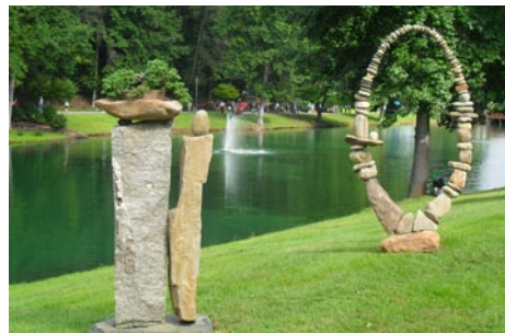
Works by Carl Peverall

For further information check our NC Institutional Gallery listings, call the Council at 828/754-2486 or visit ( www.caldwellarts.com ).