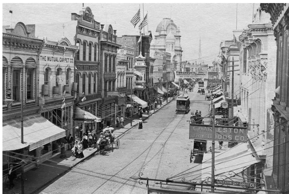
King Street, 1901