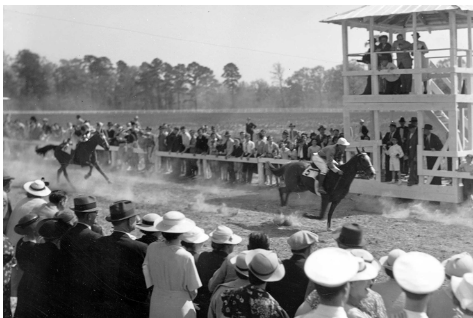
St. John's Jockey Club Spring Race, Belvidere Plantation, April 3, 1937