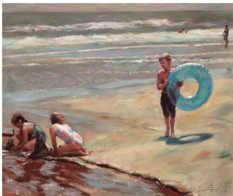
GLENN HARRINGTON, TIDE POOLS AND BLUE TUBE, 20x24, OIL ON LINEN

THE SANCTUARY AT KIAWAH ISLAND 1 SANCTUARY BEACH DR, KIAWAH, SC 29455 843.576.1290 WWW.WELLSGALLERY.COM