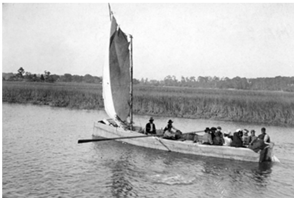
An Inter-Island Liner, A Charleston Tidal Creek, c. 1900

For further information check our SC Institutional Gallery listings, call the Museum at 843/722-2996 or e-mail to ( nfo@charlestonmuseum.org ).