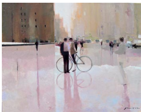
Work by Jeff Jamison

Jamison's new works for this exhibit will bring the viewer right into the scene while simultaneously allowing them to create their own version of what that feels like. We are delighted to invite you to escape into Jamison's timeless realm of long-lost lovers as they reunite in dream-like cities, cozily tucked beneath the glow of an umbrella. You might feel the urge to suddenly ride your bicycle along a sunny side street in Charleston, or your breath might catch at the sight of couples waltzing in a luxurious ballroom. All of this is normal, in fact, it is the provocation of the senses that Jamison seeks in his works.