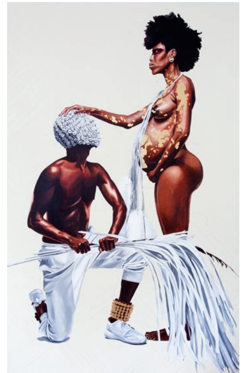
Fahamu Pecou, “something eternal”, 2016, acrylic and gold leaf on canvas, 96 x 60 in.

For further information check our NC Institutional Gallery listings, call the Center at 919/962-9001 or visit ( http://sonjahaynesstonectr.unc.edu/ ).