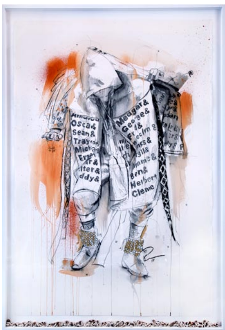
Fahamu Pecou, “Egun Dance 1”, 2016, graphite and acrylic on paper, framed with cowries, 60 x 48 in.

For further information check our NC Institutional Gallery listings or visit ( ackland.org ).