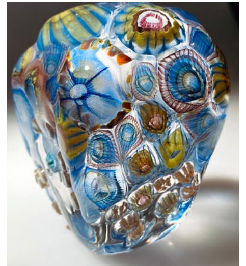
Work by Pringle Teetor

For further information check our NC Commercial Gallery listings, call the gallery at 919/732-5001 or visit ( www.HillsboroughGallery.com ).