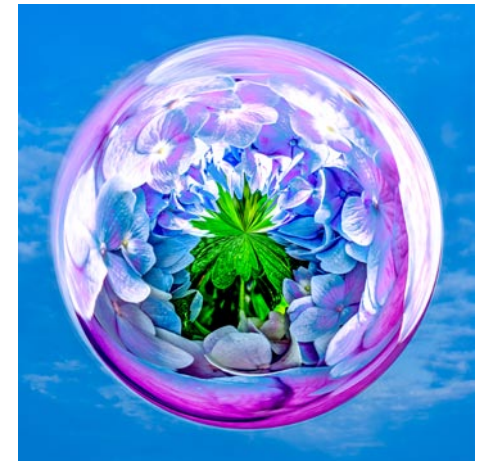
Work by Sandy Dimke

Art League of Hilton Head Gallery , at the Arts Center of Coastal Carolina, 14 Shelter Cove Lane, Hilton Head Island. Sept. 1 - 26 - "Earth to Sky". The SC chapter of National Association of Women Artists, an elite group of 47 painters, mixed media artists, sculptors and photographers, is showcasing juried member works inspired by the beauty and solitude of land and sky. The artists and their works represent an eclectic mix of styles and media. From bright and bold to monochromatic and somber, from naturalistic to abstract, the pieces all celebrate our vast earth and beautiful skies. Ongoing - Featuring works by members of the Art League of Hilton Head. Hours: Mon.-Sat., 10am-4pm. Contact: 843/681-5060 or at ( www.artleaguehi.org ).