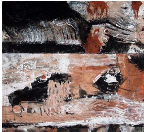
Work by Sue Mulcahy

“My abstract images are an exploration of the mysteries of life. In poetry, it is in the things that are not said, that truth lies: the space between the lines, the underlying rhythms and structures. My images operate in much the same way. If my audience is touched, it is through their own exploration,” says Mulcahy.