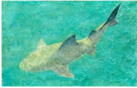
Work by Steven Gately

For further information check our SC Institutional Gallery listings, call the gallery at 843/661-4637 or visit ( www.fmarion.edu/universityplace ).