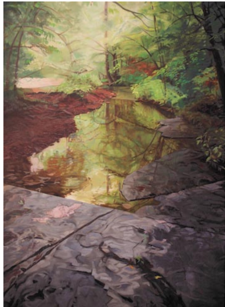
Work by Claire Hampton

“I like the immediacy and intimacy of drawings; for me they, make the touch of the artist’s hand most visible,” adds