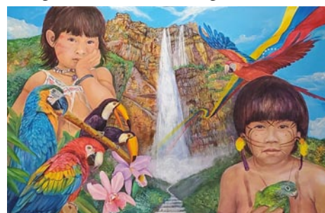
Work by Luz Celeste Figueroa

Several special events are associated with the exhibit. Visitors can view a mural on the exterior of the Morris Center designed by Jesse Aguirre and painted by local high school students as well as meet the artists on Sept. 11, at 5pm. VeMe Day is Sept. 25, from 11am to 1pm.