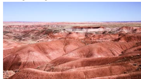
Work by Carey J. King

For further information check our NC Institutional Gallery listings, call the Council at 704/920-2787 or visit ( https://cabarrusartsCouncil.org/ ).