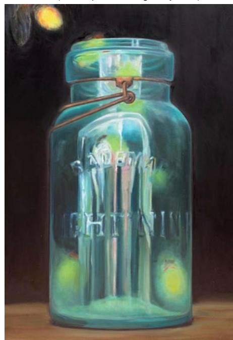
Work by Sally Tharp

The Sportsman's Gallery , 165 King Street, Charleston. Ongoing - Featuring one of the largest, most diverse collections of contemporary sporting and wildlife art found today and once having viewed it, we are confident you will concur. Hours: Mon.-Fri., 10:30am-5:30pm, Sat., 11am-5pm or by appt. Contact: 843/727-1224 or at ( www.sportsmansgallery.com ).