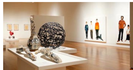
View of LOVE exhibit at Cameron Art Museum

Hannah Block Historic USO/Community Arts Center , 120 South Second Street, Wilmington. Sept. 22 - 30 - "8th Annual ART FALL". Hours: Mon.-Thur., 9am-9pm; Fri., 9am-4pm; and Sat. 9am-noon. Contact: 910/341-7860.